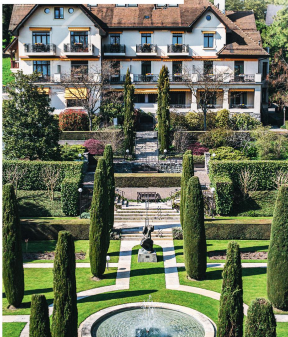
Holistic healing is at the heart of a stay at Clinique La Prairie

Doubles from £125, including breakfast (ensanahotels.com).