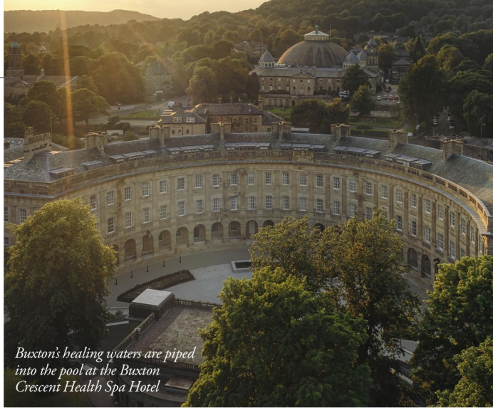
Buxton's healing waters are piped into the pool at the Buxton Crescent Health Spa Hotel

Three-night programmes start from £4,690, full board and inclusive of treatments (cliniquelaprairie.com).